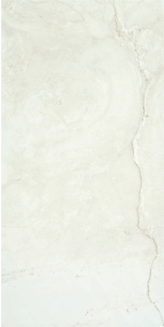
BLANCO 30 x 60 cm (11.82" x 23.63") Matte Finish UN.CS.BLC.1224.MT