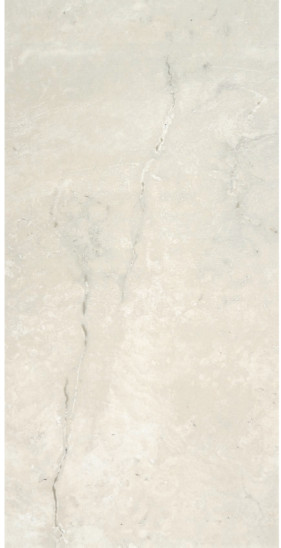
GREY 30 x 60 cm (11.82" x 23.63") Matte Finish UN.CS.GRY.1224.MT

All items shown in this document are part of Olympia's stocking program. For special orders, please contact your Olympia Tile Sales Representative.